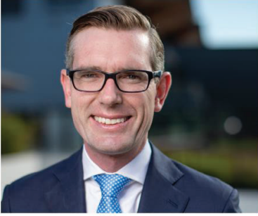
Dominic Perrottet MP Premier of New South Wales